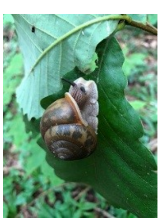
Emery Creek pictures from Tim