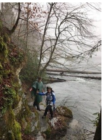
Isn't this a beautiful shot!